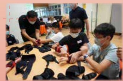
個性化活動盡顯才華：咖啡人生、振興龍獅隊 Personalized Activities to Cater for Diversity: Coffee and Life, CGHC Dragon and Lion Dance