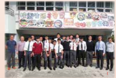
喇沙大家庭：和聖若瑟書院、喇沙書院等喇沙會學校進行交換生計劃 Students Exchange Programme Within the Lasallian Family: We are One but We are Many